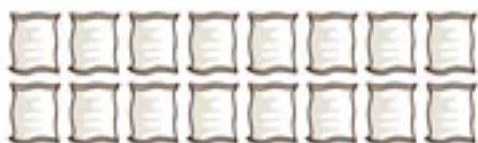
16 bags of clay granules